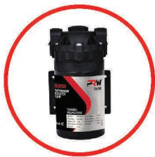
BOOSTER PUMP (SILVER)