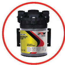
BOOSTER PUMP (GOLD)